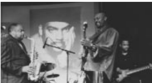
Entertainment provided by the world renown Gerald Albright.