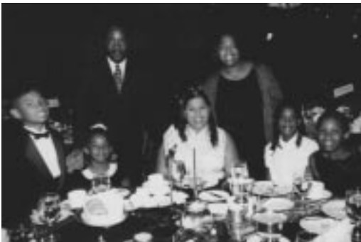
The youth had a night to remember.